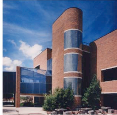
Student Service/ Learning Resource Center Terra Community College Fremont, OH