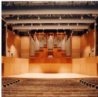
Waetgen Hall Renovations; Cleveland State University Cleveland, OH