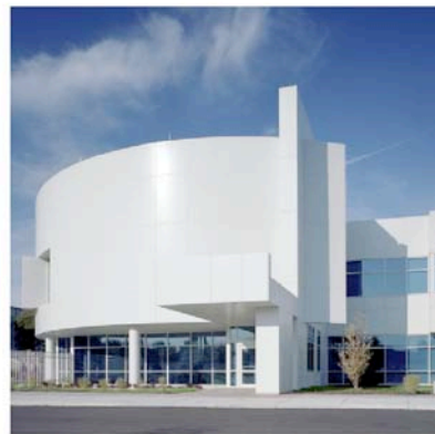
Vocational Guidance Services Training Center Cleveland, OH AIA Cleveland Design Award IIDA + IESNA Regional Design Awards